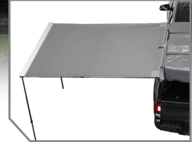
ATTACH TO PASSENGER AND DRIVER SIDE OF VEHICLE