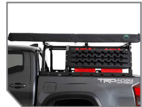
PACKS INTO 1000G PVC TRAVEL COVER