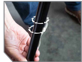
TWIST AND LOCK AWNING POLES